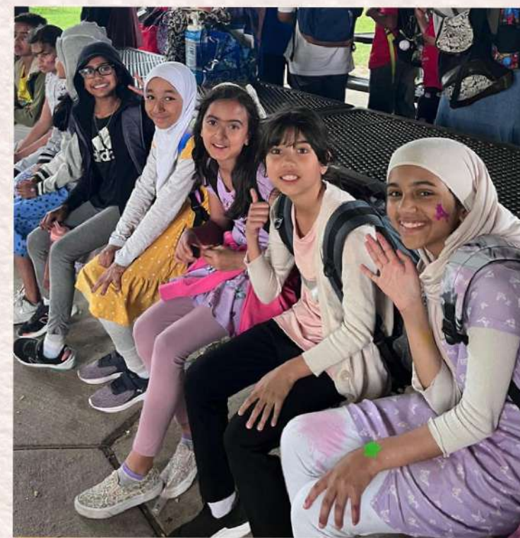
Ready for a day at Neilson Park!

All praises belong to Allah, the Lord of the Universe, and may He send Peace and Blessings on the best of creation, al-Mustafa (Peace and Blessings be upon him.)