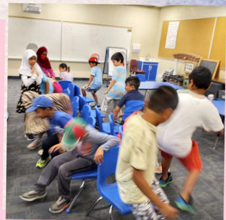
A game of Nasheed Chairs